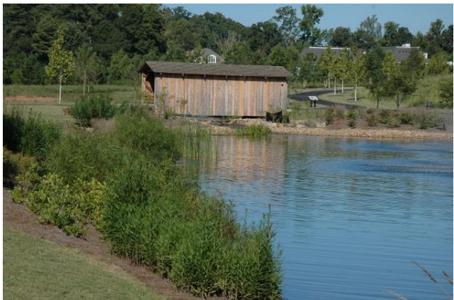
Photo at right: the 2010 Outstanding New Development Award: Hughes Good O’Leary & Ryan Landscape Architects and Planners for the Johns Creek Environmental Campus landscape design.

Please limit to the space allowed on form. If handwriting your image descriptions, please write neatly and legibly.