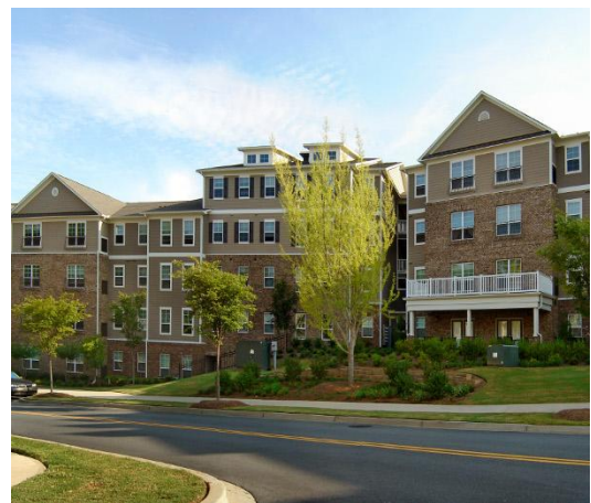
2010 Outstanding Streetscape Revitalization Award: The Housing Authority of DeKalb County for the Johnson Ferry Redevelopment