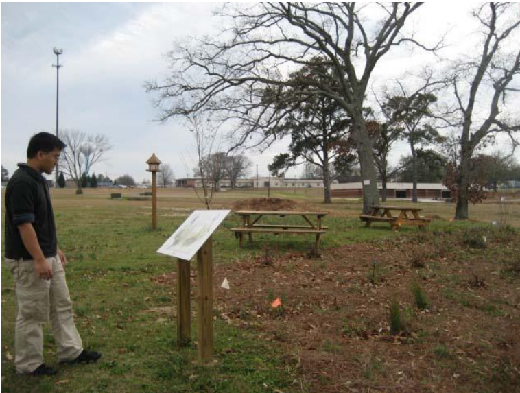
2010 Outstanding Student Award – Georgia Military College Biology Club for the Warner Robins Community Gardens & Interpretive Trail