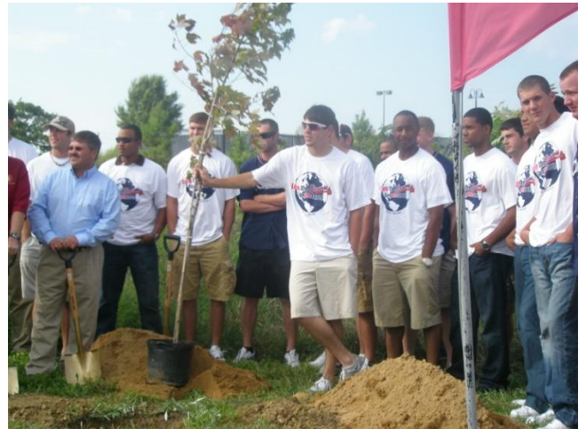
2009 Outstanding Business Award: The Rome Braves for "Home Runs for a Greener Rome"