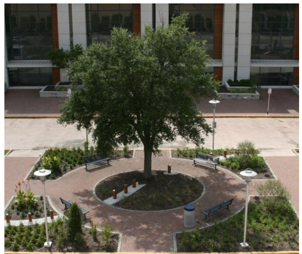
Photo at right: the 2009 Outstanding Streetscape Revitalization Award: Bryan Square waterSmart Demonstration Garden, Savannah

Please limit to the space allowed on form. If handwriting your image descriptions, please write neatly and legibly.